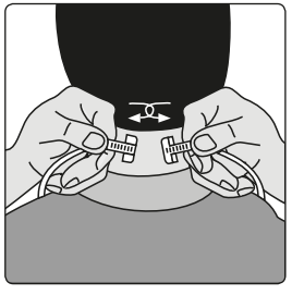
5. During breaks unclip strap.

Place respirator on chin and pull loop over head tight to the neck.