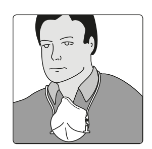
6. Let mask hang around your neck.