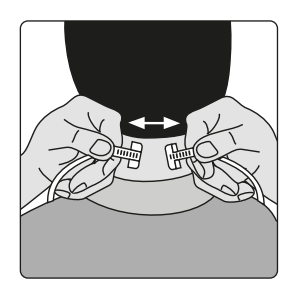
5. During breaks unclip strap.

4. Adjust strap by pulling loop on strap.