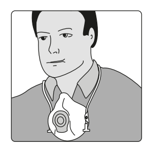
6. Let mask hang around your neck.