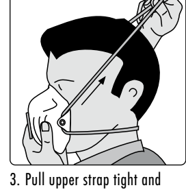
then place on back of head.