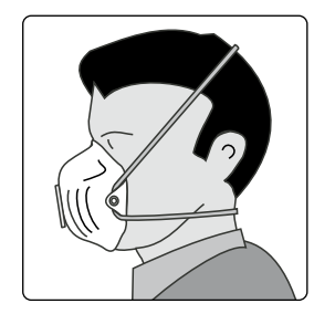
4. Ensure respirator fits secure and comfortable.